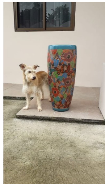
Pottery is in your future! Visit Rom Gallegos on FB to see what is available.